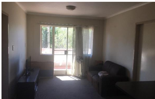
LOUNGE & KITCHEN